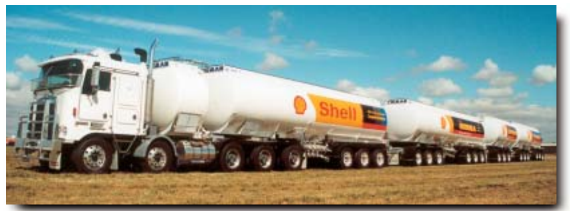
NT Fuels 2A B Double, Worlds largest fuel road train. Fitted with 5 BOOTH Safety rail systems