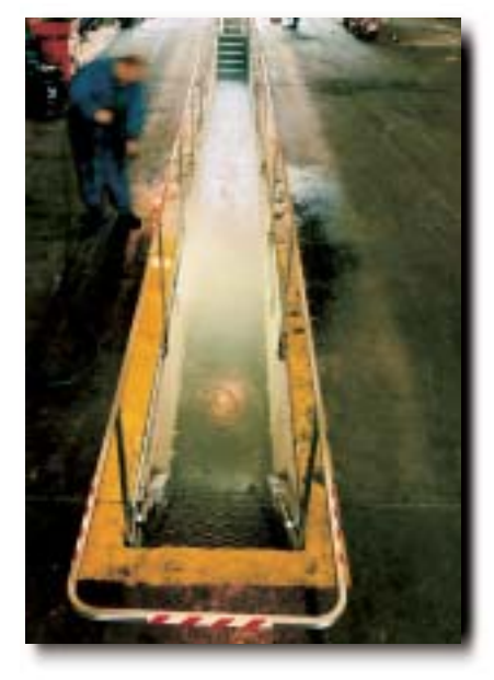
Workshop Pit protection:

For more information, visit our website at www.boothengineering.com