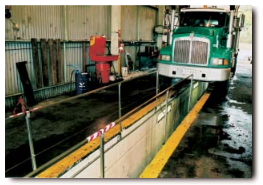
Front half raised and rear half lowered (under truck)